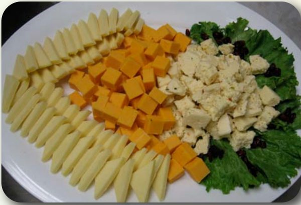
Domestic Cheese Platter

QUICHE $11.45 Served with salad, dinner roll and choice of dessert. Chef's choice or requested flavours