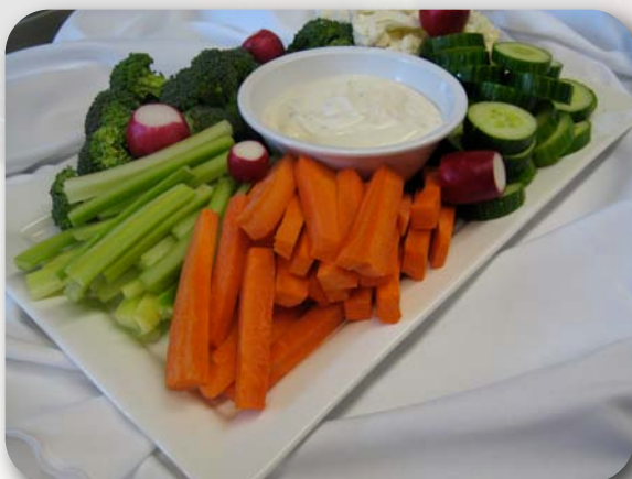
Crudities & Dip

DOMESTIC CHEESE $3.25 Assorted crackers and 3 varieties of cheese (1.5 oz) per person